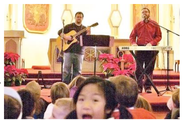
culate Conception School students enjoy the sounds of Odd Walk during Catholi Schools Week. Ss. Peter & Paul School and Gibault High School, both in Waterloo, also participated in CSW.

This year's CSW started last Sunday and wrapped up Friday, with each day reserved for a separate celebration.